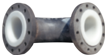
Large Diameter Lined Pipe