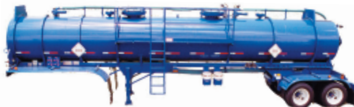
DOT Approved Tanker Trailer