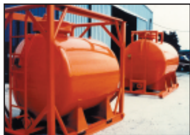
Offshore Coast Guard Approved Vessels